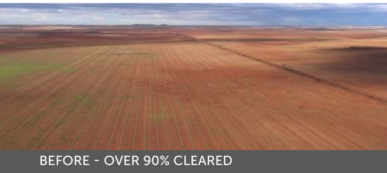
BEFORE - OVER 90% CLEARED