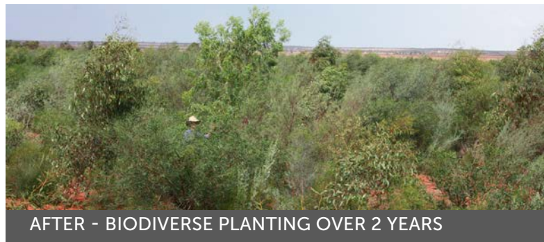
AFTER - BIODIVERSE PLANTING OVER 2 YEARS

Trees are the world's single largest source of breathable oxygen and play a vital role in maintaining safe levels of carbon dioxide and addressing climate change. Replanting in the Yarra Yarra Corridor helps to sequester carbon dioxide, conserve soil and water, prevent salinity and protect and stabilise ground cover.