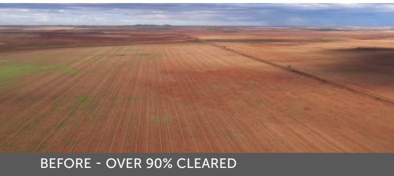
BEFORE - OVER 90% CLEARED