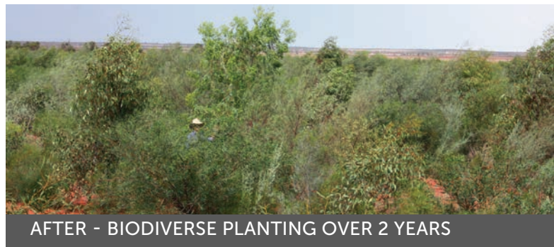
AFTER - BIODIVERSE PLANTING OVER 2 YEARS

Trees are the world's single largest source of breathable oxygen and play a vital role in maintaining safe levels of carbon dioxide and addressing climate change. Replanting in the Yarra Yarra Corridor helps to sequester carbon dioxide, conserve soil and water, prevent salinity and protect and stabilise ground cover.